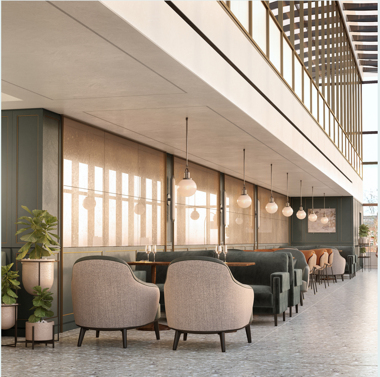
Member's Club Lounge